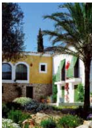
Clockwise from far left: Benirras sunset, yoga with Ibiza Restreats, Atzaro spa, Can Gasi finca

I'VE BEEN TO Ibiza more times than I can count — but this trip is different. I've come purposely to experience Ibiza's holistic side — the one without alcohol, dance culture and consumerism. My body will benefit. But will I have fun?