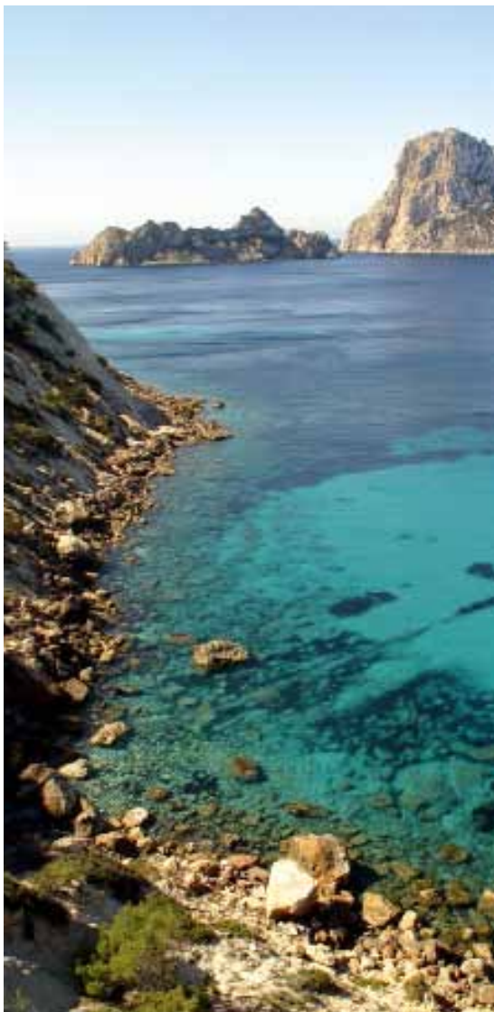
From top: View of Es Vedra; Can Curreu villa pool

"Is a week long enough to see a marked improvement in my body and soul?" I ask. "Half an hour can make a difference," he replies with a sense of knowing, confidence and calmness that I wish I could bottle up and take home. >